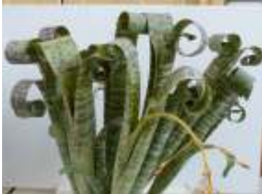
Quesnelia 'Tim Plowman'