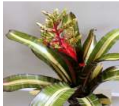
Aechmea 'Roberto- Menescal'