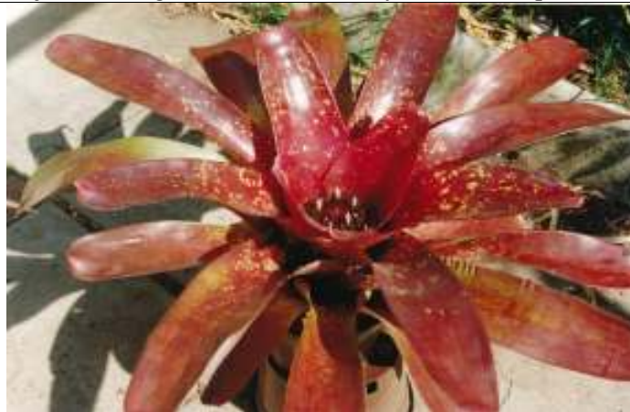
Neoregelia 'Bobby Dazzler'

I enclose a photo to show what 'Bobby Dazzler' looks like. We do not know how many plants Grace got from George but the assumption could well have been that all called acanthocrater x proserpine should be called 'Bobby Dazzler' even if they were clearly different. If they are different they should be called Neoregelia hybrid or just nothing in line with so many unnamed orphans being grown.