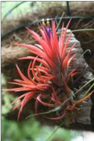
Tillandsia ionantha

Patience is a requirement when growing Tillandsia’s. These two plants were obtained in early 2012, attached to their mounts and since then have been slowly growing. They both flowered for the first time in December 2015. During that time they have hung on the side of pots of Australian Native Orchids, open to all the elements and have never been fertilised. They have broadly faced a north easterly direction with sunshine varying from full and direct to dapple shade. The end results are delightful and well worth waiting for.