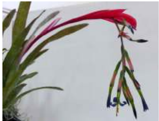
Billbergia 'Blue Wren'