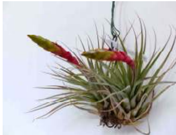
T. compressa

Finally, there were two plants on the same bit of wood, flowering with single spikes but called Tillandsia fasciculata . To me the 'normal' T. fasciculata has a branched spike so I felt the plants concerned were T. compressa . On returning home to the den I still feel I am right but then it is easy to recognise the T. fasciculata complex but in many cases hard to pick out which species or variety you want to link your plant to.