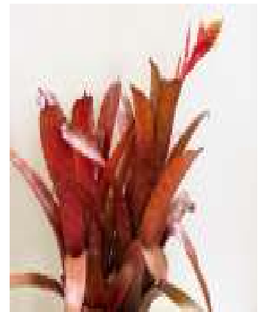
Aechmea 'Nigre Nudicaulis'