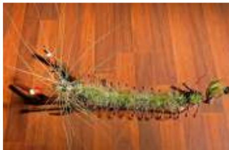
"Creeping creature"