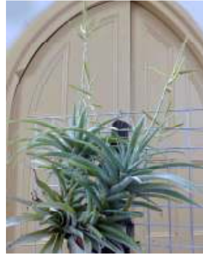
Tillandsia latifolia 'Dotterer'

What makes a plant flower? It is because it is growing in such good conditions that it explodes with happiness? Is it because it is on its way out and tells itself it must flower and set seed for the genome to survive? This was discussed when looking at Ron Master's flowering Tillandsia latifolia 'Dotterer'. The 'Dotterer' part is important because I rescued it from Dotterer's nursery in Germany in 1996. It looked different. T. latifolia comes in many shapes and sizes and this was one of the larger forms with vigorous offsetting ability. There is one variety called var. divaricata where all side branches of the inflorescence are at right angles to the main axis but the way Ron is growing his plant tends to disagree with this AND the floral bracts are very pale, making me think that Ron was not telling the full story!