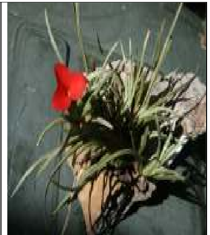
Tillandsia albertiana