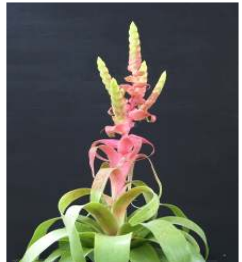
Tillandsia 'Samantha'