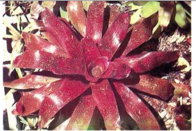
Neoregelia 'Charm'