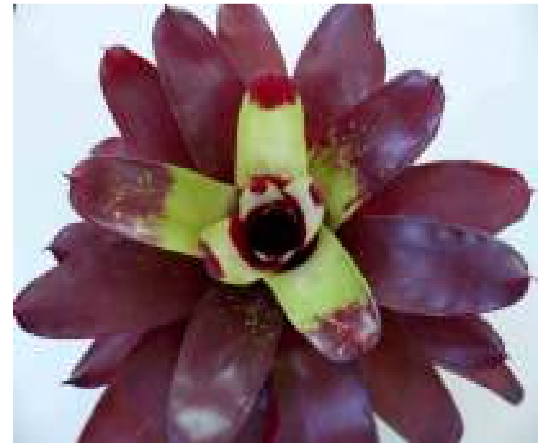
Neoregelia 'Sweet Dreams'