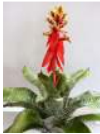
Aechmea 'Deleon's Chantinii'