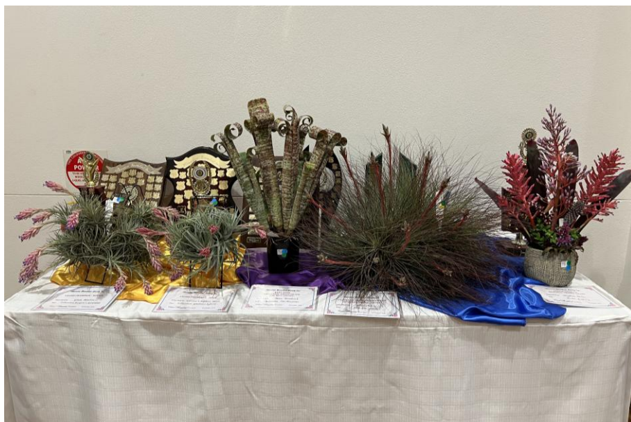
Above left: Awards table