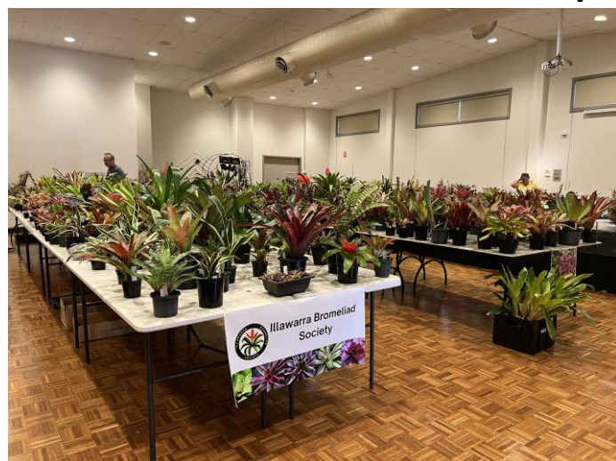
Above left: The sales tables were full of beautiful bromeliads