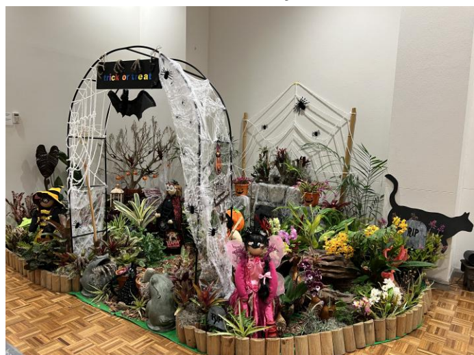
Above right: Another view of the Bromeliad display