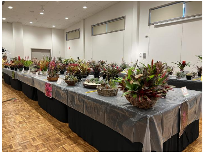
Above and below: Tables full of gorgeous bromeliads entered into our annual competition