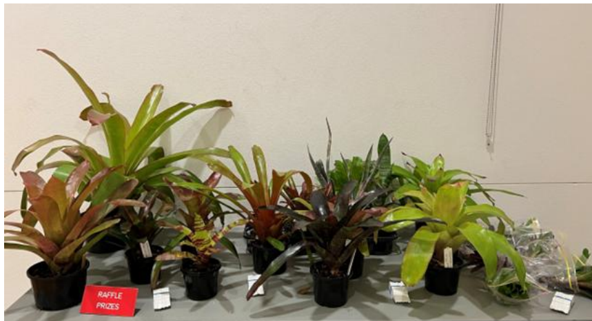
Left: We had some beautiful Bromeliads on our raffle plants at our April meeting