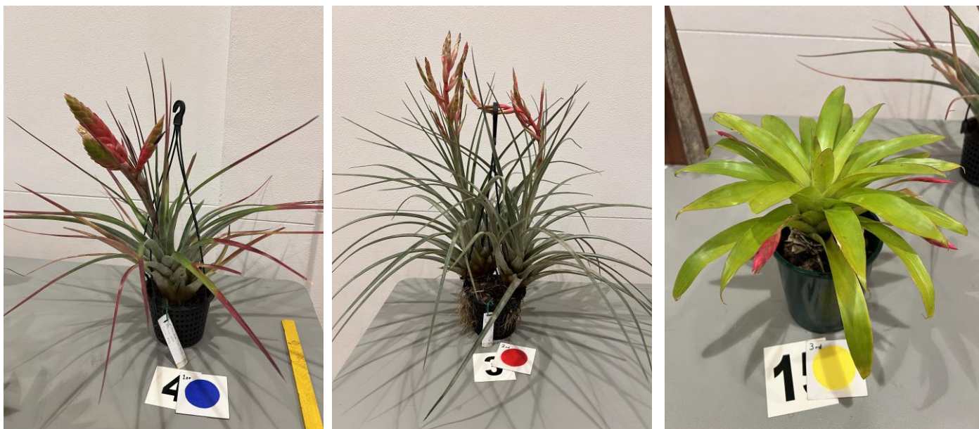
Tillandsia Section above, left to right: First place – Tillandsia fasciculata 'Dennis' Second place - Tillandsia fasciculata No. 14 Third place - Tillandsia complanata