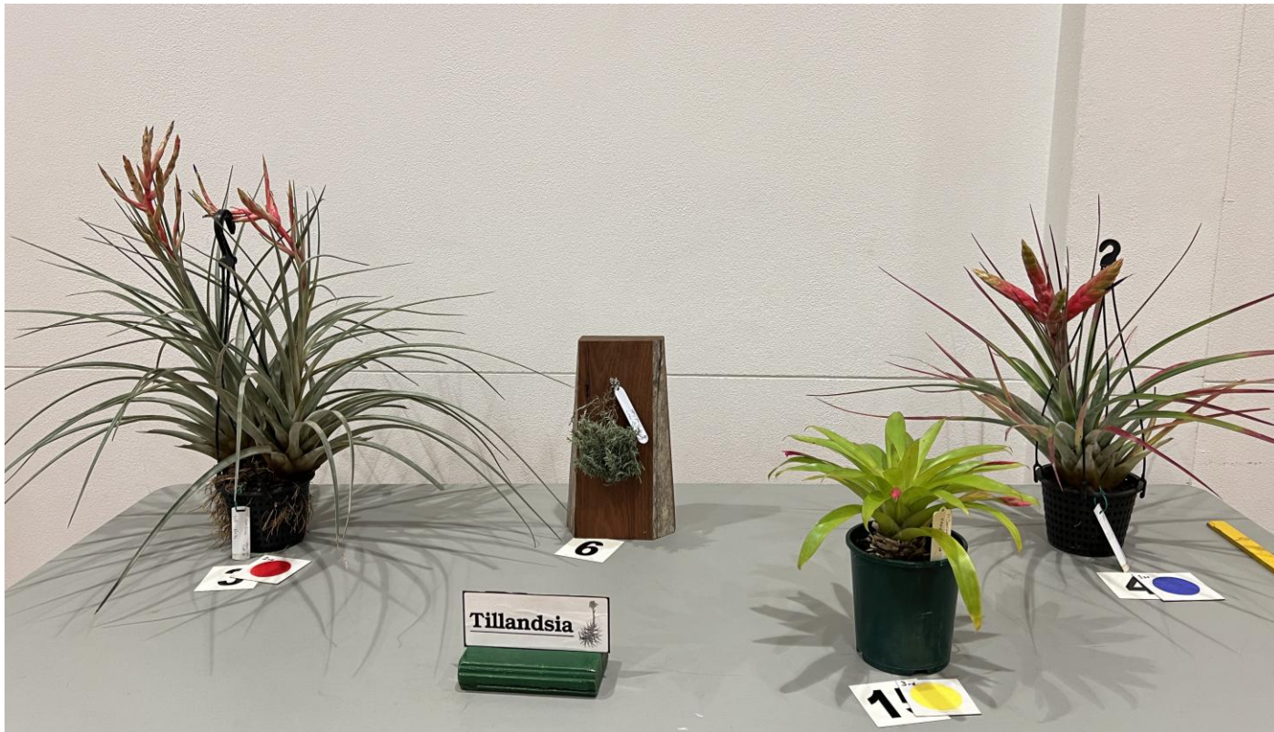
Above: Tillandsia Section , which had 4 entries