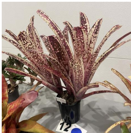
Above left: Open Section which had 9 entries Above right: First place – Billbergia B A Bubblz