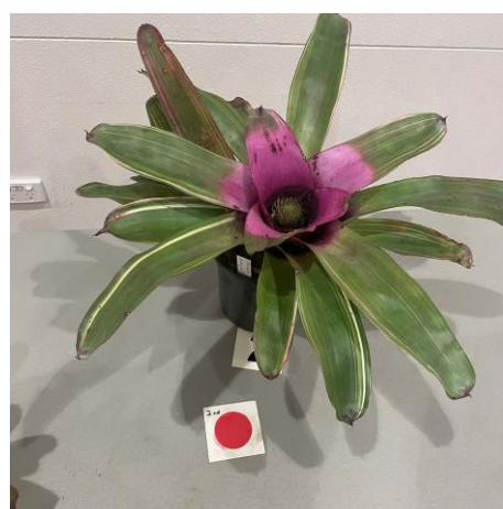
Above left: Novice Section had 2 entries Above middle: First place – Neoregelia carolinae Above right: Second place – Neoregelia Koah Knotalot