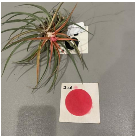
Tillandsia Section above, left to right: Equal first place – Tillandsia fasciculata hybrid Equal first place - Tillandsia Hal's Nidus Second place - Tillandsia velutina