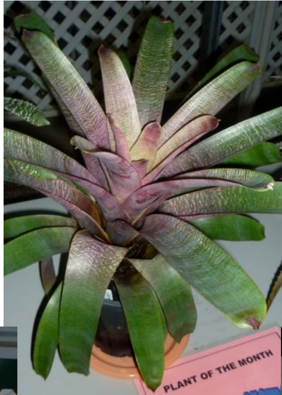
1 ST Ardie Baker's Vriesea Hybrid