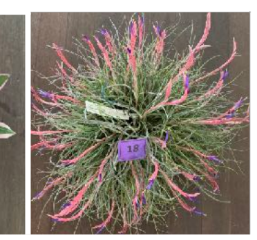
Vriesea 'Rosita' [N.R.]