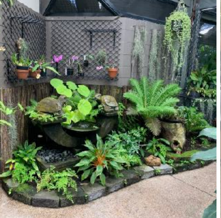
Inside the Orchid House