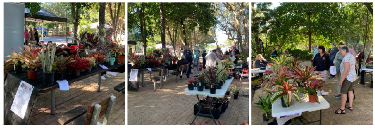
Our Bromeliad Display

The day provided the Society with good exposure to public with lots of pamphlets being given out and some sales. It was a successful public relation and promotional event, thanks to those members who assisted. Below a few photos from the day.