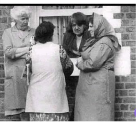
F.C.B.S. Inc. Newsletter