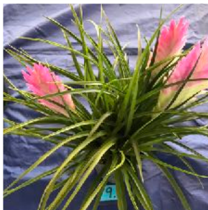
Wallisia cyanea