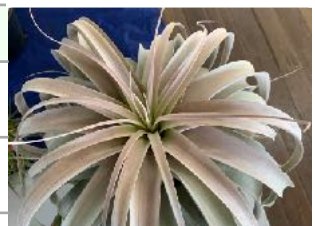
Tillandsia xerographica Ian Fluerty