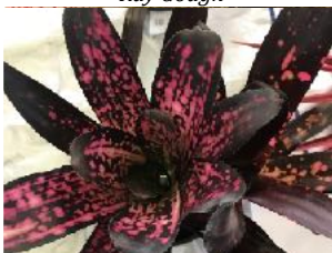
Billbergia 'Kawana Bright Spark'