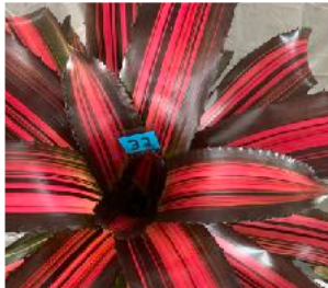
Neoregelia 'Julia'