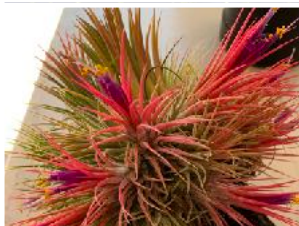
Tillandsia 'Cone Head'