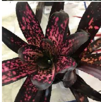
Billbergia 'Kawana Bright Spark'