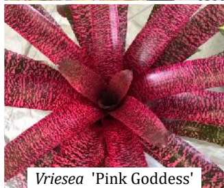
Vriesea 'Pink Goddess'