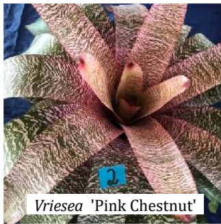
Vriesea 'Pink Chestnut'