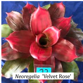
Neoregelia 'Velvet Rose'