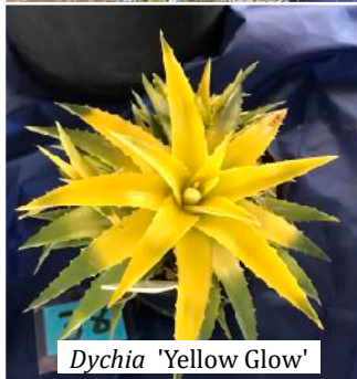
Dychia 'Yellow Glow'