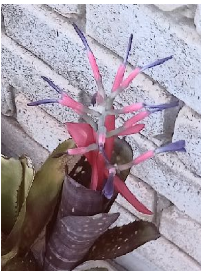
Left : A beautiful Bromeliad species in flower last month from Irene Lippross' garden.

SOURCE : The above article was reproduced from BROMELETTER ( Vol.59 No.7 Page 20 ) - The official journal of the Bromeliad Society of Australia Incorporated.