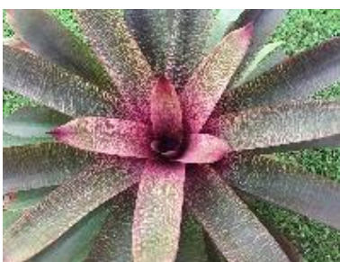
Vreieseae 'Kara Dusty Glow'

The plants below are some of Goff's hybrids that have been registered by Ian Fluerty.