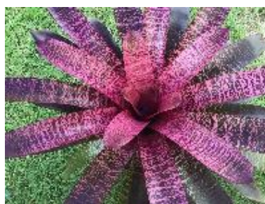
Vreieseae 'Kara Divine'