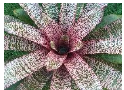
Vreieseae 'Kara Pearl'