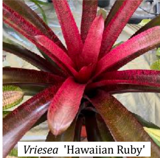
Vriesea 'Hawaiian Ruby'