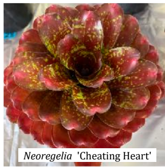
Neoregelia 'Cheating Heart'