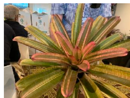
Un-named seedling Vr. 'Gulz' X Vr. 'Big Red Fosteriana'