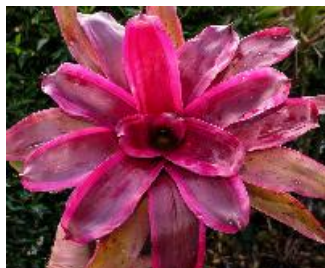
Neo. 'Mai Purple Passion'