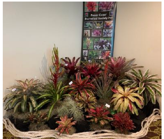
Our Convention display ... another wonderful Maxine creation.

Although there were no formal events, most delegates remained at the hotel and socialised in small groups in the bistro for dinner.