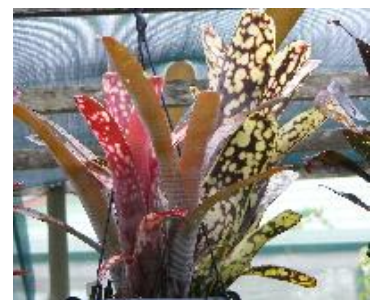
Billbergia 'Val's Joy'

She has done a lot of hybridising and told us that Billbergia growers get more sleep than Vriesea growers.