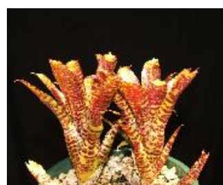
Neo. 'Ritzy Tiger'