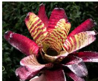
Neo. 'Sunfire Dream'