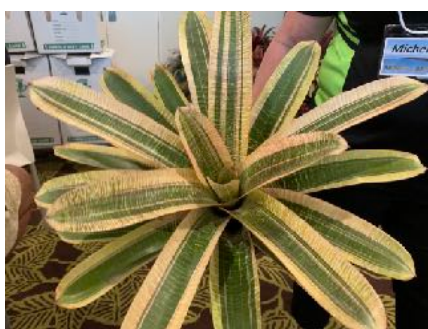
Vr. 'Dream Maker'