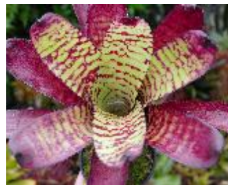
Neo. 'Sunfire Fever'

Finishing up, he showed us some of the Begonias and tropical plants that he had a bit of fun with during lockdown.