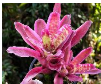
Neo. 'Golden Aztec'

Finishing up, he showed us some of the Begonias and tropical plants that he had a bit of fun with during lockdown.