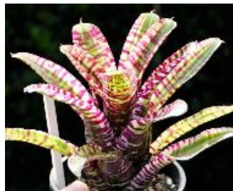
Neo. 'Mai Java Lava'