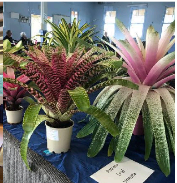
Plant of the month entries with member voting and discussion taking place.