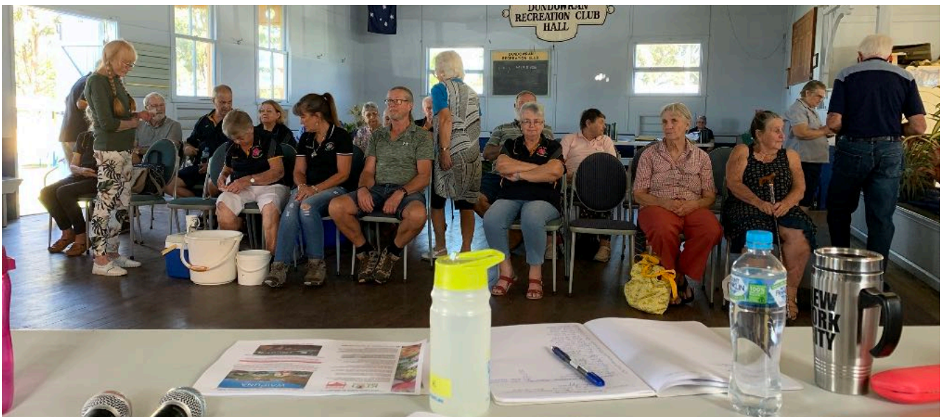
A different view for Les this month - 'From the President's Chair'