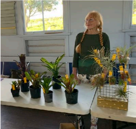
A quiet Plant Sales table this month.