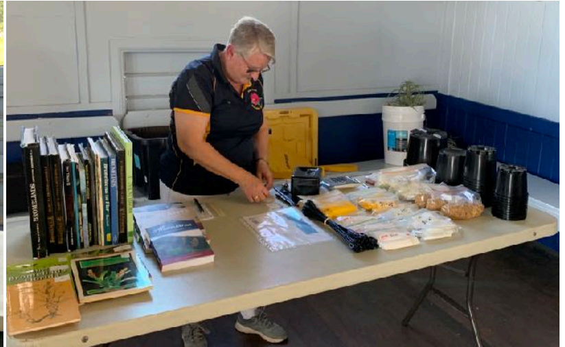
Library and Garden supplies table.