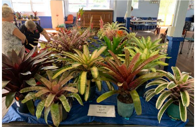
Plant of the Month entries - Pattern Leafed Vrieseas