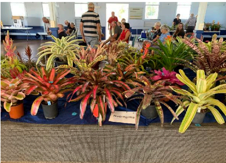
Plant of the Month entries - Neoregelias & Tillandsias