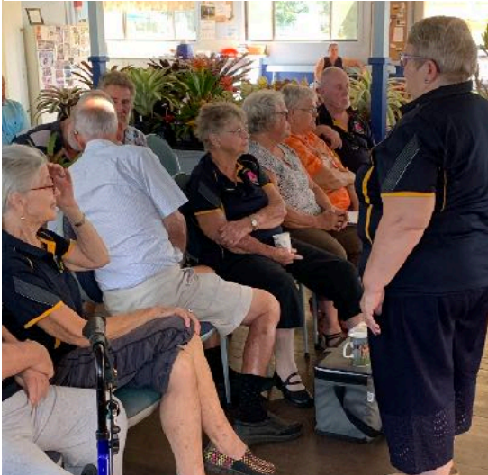
Show N Tell discussion.