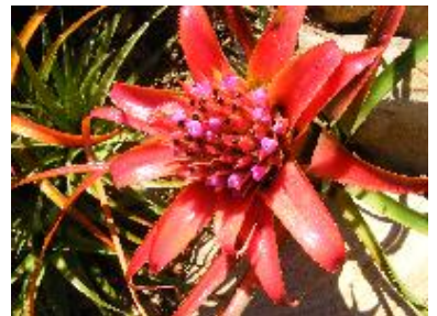
Aechmea 'Rock Lobster'