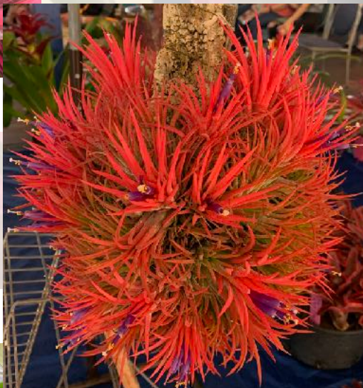
Above : Tillandsia ionantha