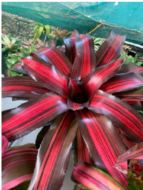
Above : Neoregelia 'Julia' ( Ian Fluerty )

At the February meeting, the Neoregelia section is "Mini - Under 200mm" and Tillandsia section is "Potted" .