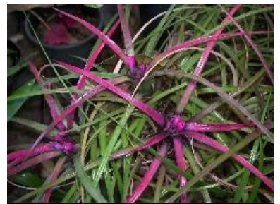
Aechmea recurvata var. benrathii