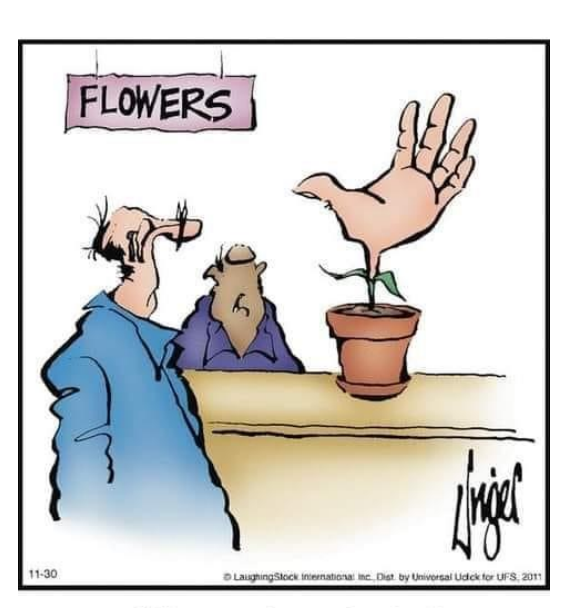
"It's some type of palm."

How many members avail themselves of the many books in the library? If you haven't done so check out what's on offer at this meeting. Some months ago we ordered a new book from Brazil on Alcantareas, and this is now available. It's not exactly light reading, but should provide some interesting insights into this particular species, so check it out.