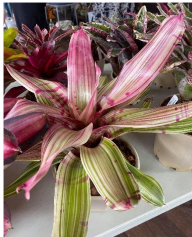
Neo New Wave