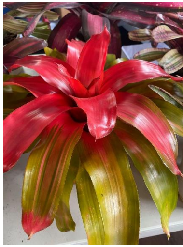
Neo Variegated Tangerine