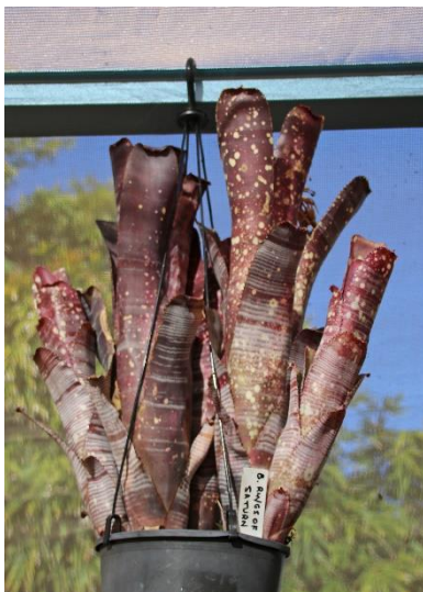
Rings Of Saturn