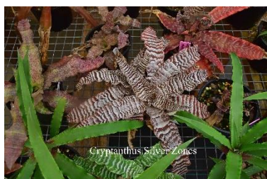
Cryptanthus Silver Zones