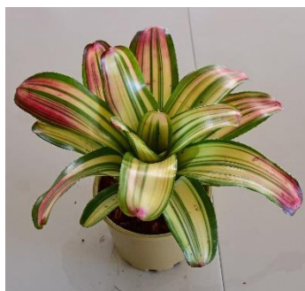
Neo Lorena Lector Variegated