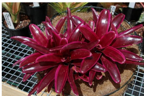
Neo Dyn-O-Mite Albo