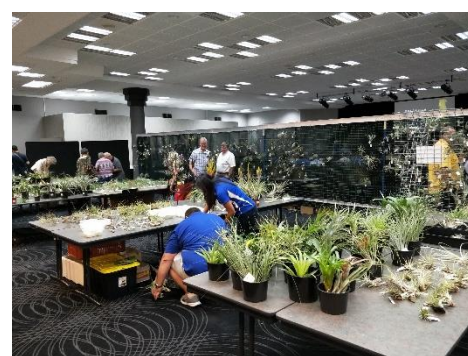
After the hordes left