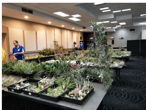
Before the sale started

The sales tables were well stocked, with plenty to tempt all tastes, and thanks to the auctioneers the Rare Plant Auction was a good laugh, and some top prices were paid. I think we all came home a lot lighter in the wallet, but with some great plants to add to our collections. If you love Tillandsias then make sure not to miss next years event, which will be advertised later this year.