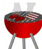
Photo Comp Winner

As per previous communications, we discussed at the meeting which day suited most people for us to look at holding our Sausage Sizzles for 2016. After a show of hands for each of the options – Tuesday, Wednesday or Thursday, the consensus was that Tuesdays are the day that suits most people to be able to assist. Next year we are reducing the number of Sizzles we are holding, looking at 1 each quarter. I will communicate dates once they are locked in.