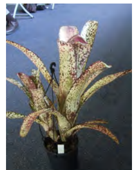
Talbot Kolan Spirit