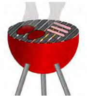
Photo Comp Winners

Can everyone please put some thought into which day would be best for our sausage sizzles next year to maximize the ability of our members to assist. The options we are looking at are Tuesday, Wednesday or Thursday