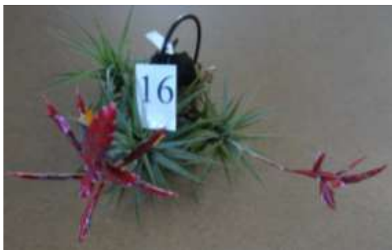
Tillandsia latifolia var. Divitflora