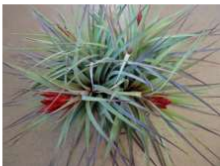
Tillandsia velutina x fasciculata