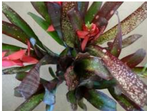
Billbergia 'Super Dooper Grace'