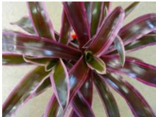
Neoregelia 'Dyno-o-mite' alba