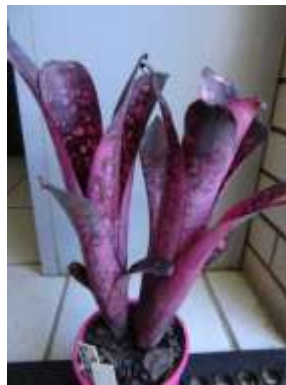
Billbergia 'Black Beauty'