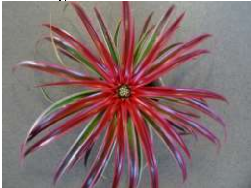
xNeophytum 'Galactic Warrior'