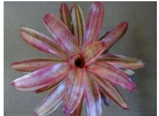
Neoregelia 'Cane Fire'