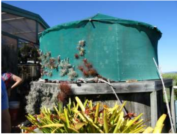
That infamous tank!

Quite ingenious – Seeds are grown inside the bush house which is placed artistically on the water tank.