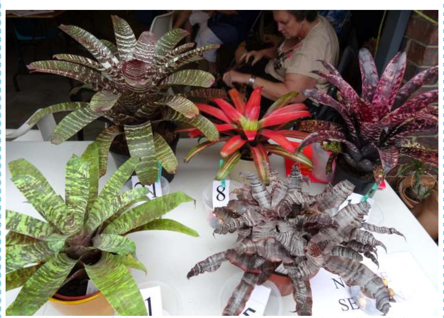
What a lovely group of well grown plants – on our novice table. It is going to be a tough contest this year. Wow!

Two interesting tidbits I noted - Tillandsia harrisii has lots of seed. Tillandsia gardneri has only 1 pup but lots of seed.