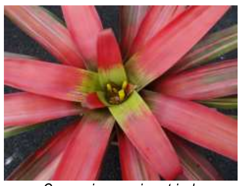
Guzmania sanguinea tricolor