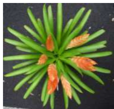
Tillandsia brachycaulis x fasciculata