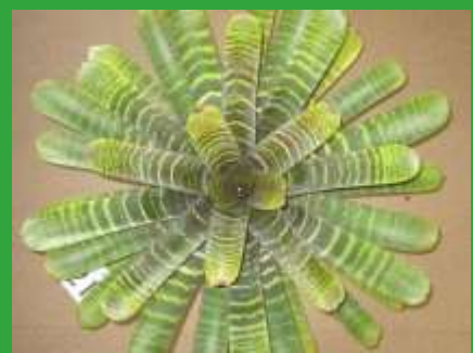
Vriesea fosteriana x Red Chestnut