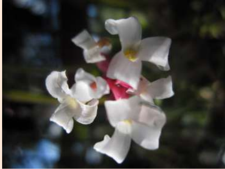
Tillandsia correia araujoii