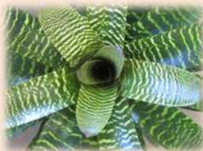
Vriesea Montezuma's Gem