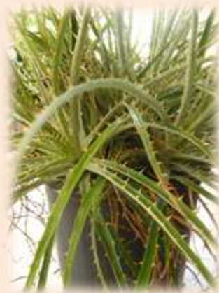
Orthophytums and xNeophytums – beautiful!