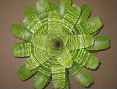
Vriesea 'Talbot Lime Splice'