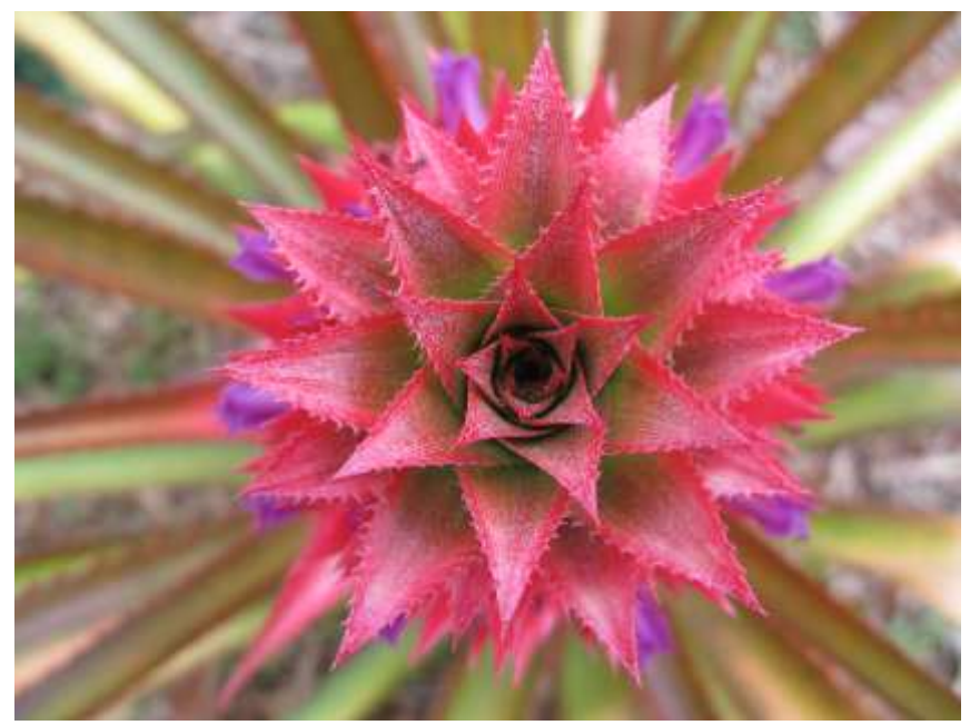
Ananas comosus var. bracteatus