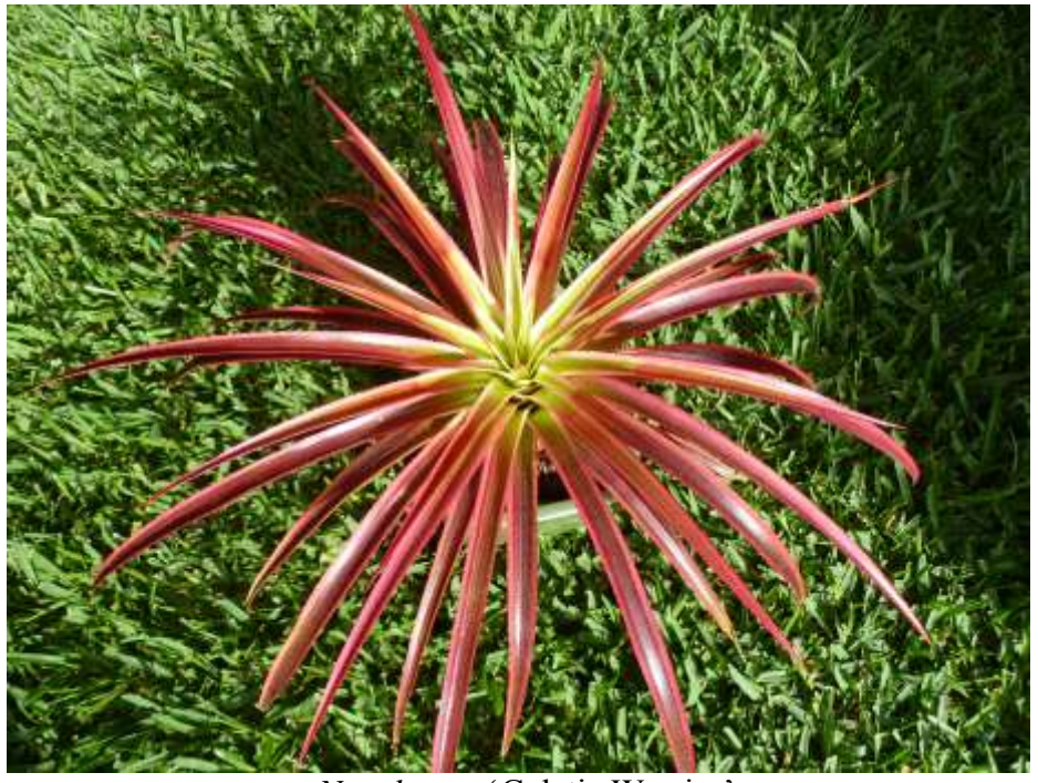
xNeophytum 'Galatic Warrior'