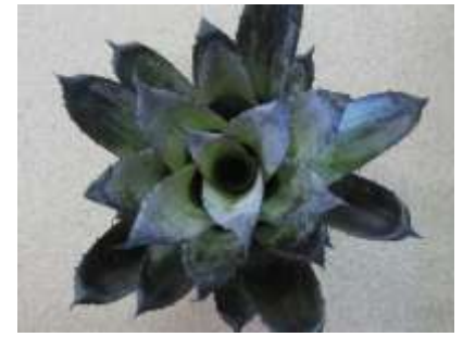
Hohenbergia leopoldo- horstii