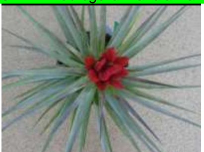
Tillandsia velutina x fasciculata