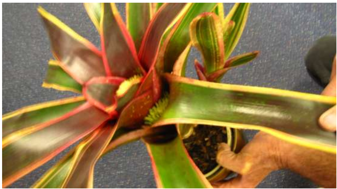
Look closely! Yes there are two flowers. Wonder what the incidence is?