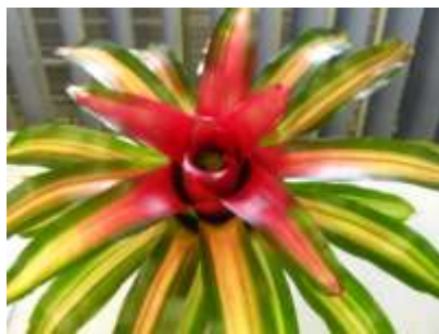
Neoregelia tricolor 'Perfector'