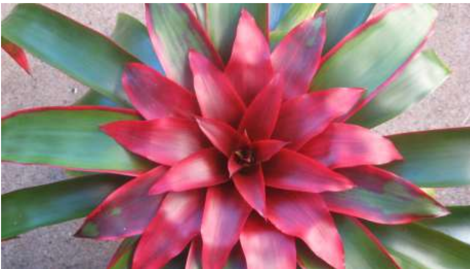
Guzmania Wendy mutant flower