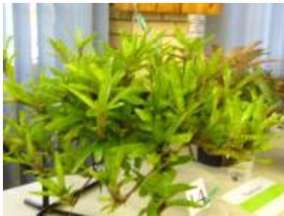
Neoregelia 'Tiger Cub'