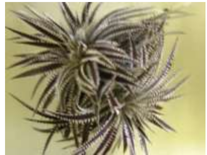
Dyckia 'White Chocolate'