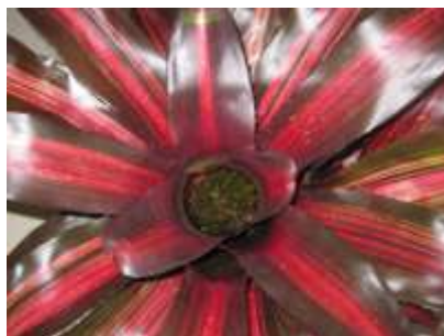
Neoregelia 'Christmas Cheer'