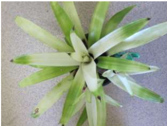
Vriesea White Cloud