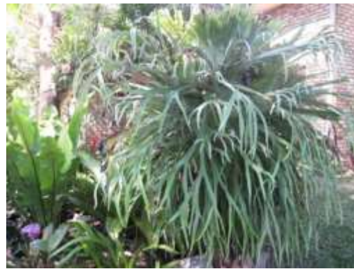
So many lovely plants amongst the broms.