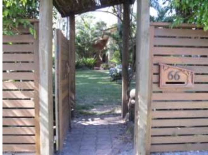
Welcome to Lyn Trail's garden.