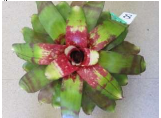
Neoregelia Strawberry Jamboree