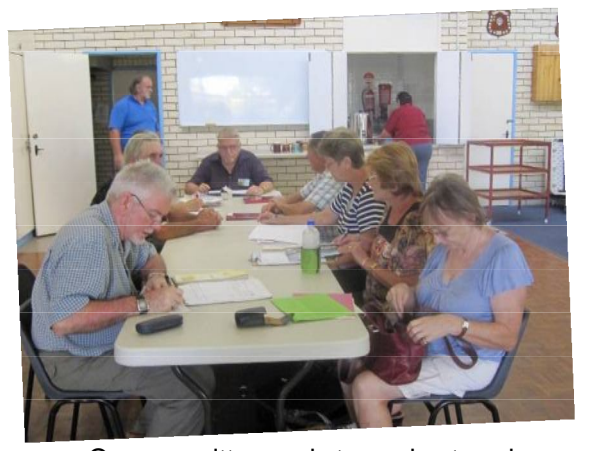
Our committee and stewards at work