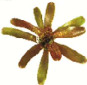
'Curly Pet Kokoderm'