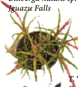
Billbergia nutans sp. 'Jguazu Falls'