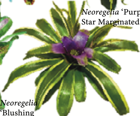
Neoregelia 'Purple Star Margined'