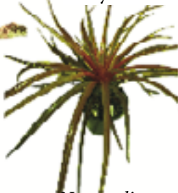
xSincoregelia 'Gary Hendrix'