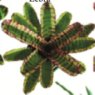
Neoregelia 'Blushing Zebra'