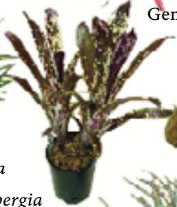
Billbergia 'Caitlands Meg'