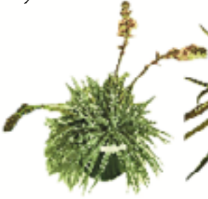
Dyckia 'Clifton Milaloo'