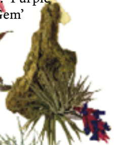
T. 'Purple Gem'