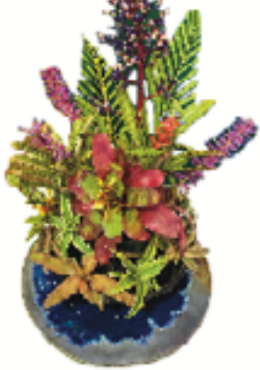
'Springtime on the Pond'