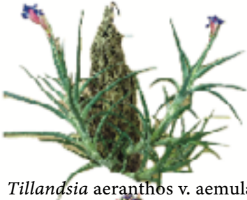
Tillandsia aeranthos v. aemula