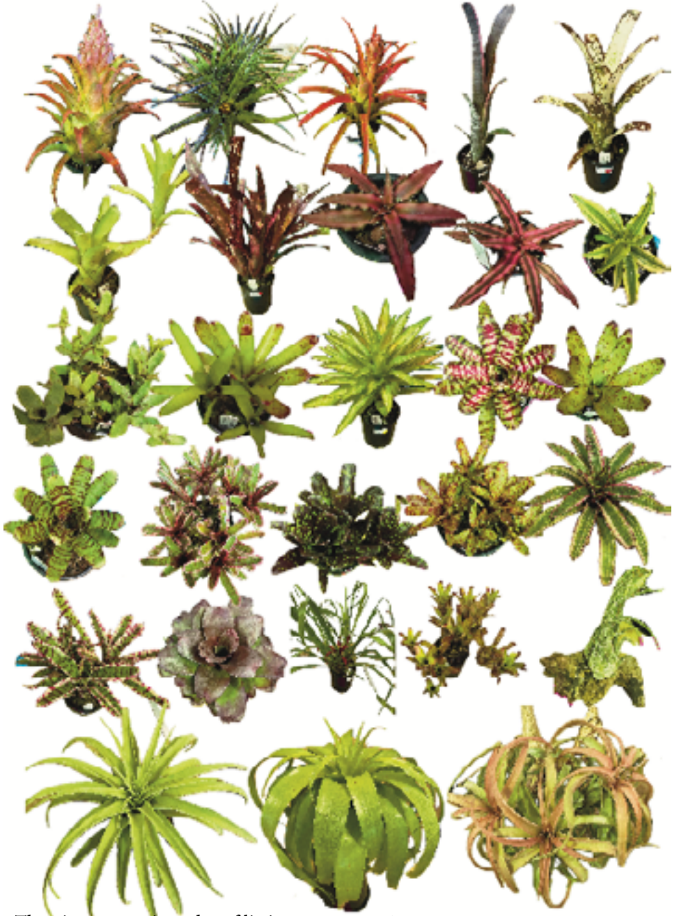
The pictures are in order of listing on pages 16-17