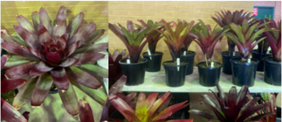
Alcantarea imperialis rubra x vinicolor 'Hawaiian Red'

He demonstrate the removal of pups and grass pup from the mother Alcantarea bromeliads and how to assist with the survival of accidentally neglected bromeliads.