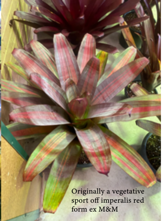
Originally a vegetative sport off imperialis red form ex M&M