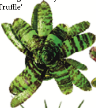
Neoregelia 'Savoy Truffle'