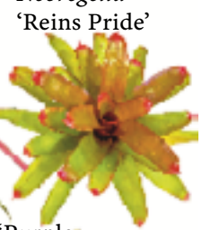
Neoregelia 'Reins Pride'