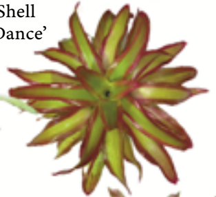
Neoregelia 'Shell Dance'