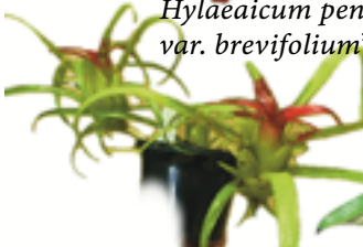
Hylaeaicum pendulum var. brevifolium '