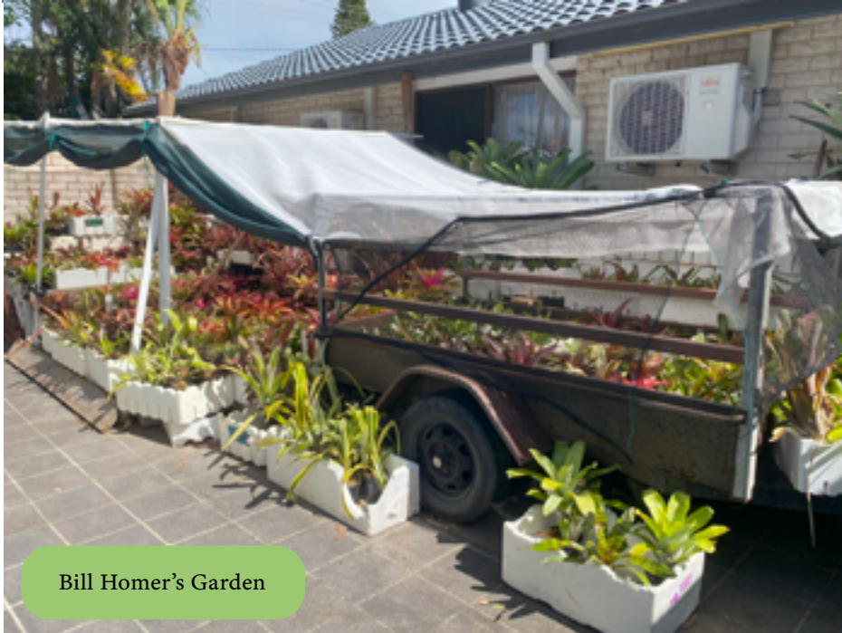
Bill Homer's Garden