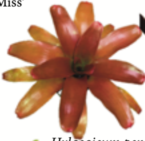
Neoregelia 'Mandarine Miss'