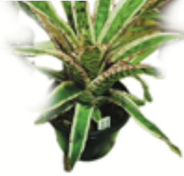
Aechmea orlandiana 'Ensign'