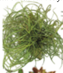
Tillandsia 'Silver Queen'