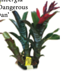
Billbergia 'Dangerous Dan'